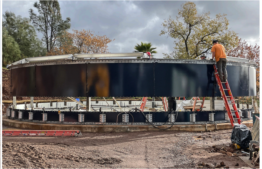
▲ TANK 9B construction progress