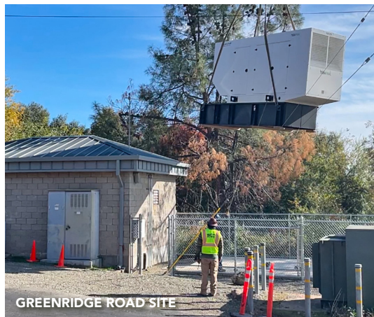
GREENRIDGE ROAD SITE