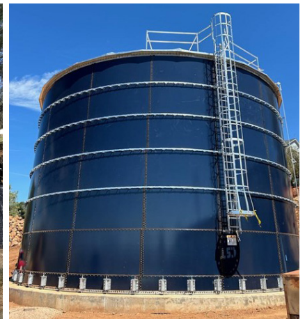
▲ AFTER (the completed new tank)