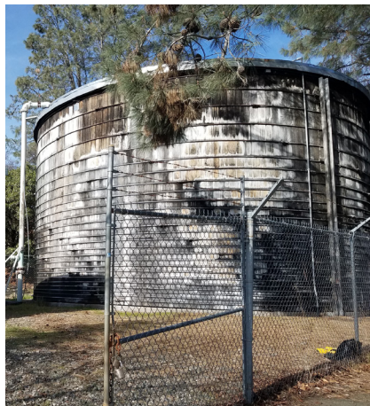
▲ BEFORE (redwood tank)

As work continues, please be aware of the increase in activity in the area. Be sure to abide by all traffic signs and flaggers for everyone's safety.